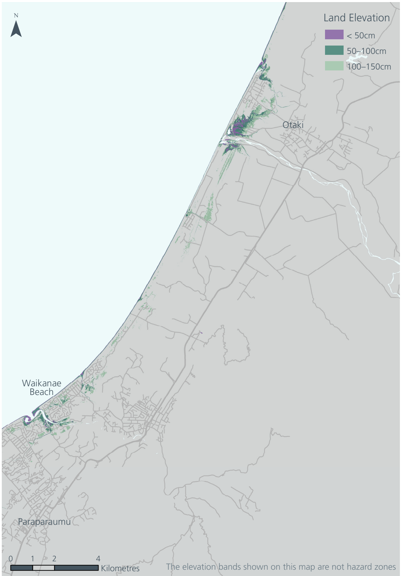
Low-lying coastal land in Otaki and Waikanae.