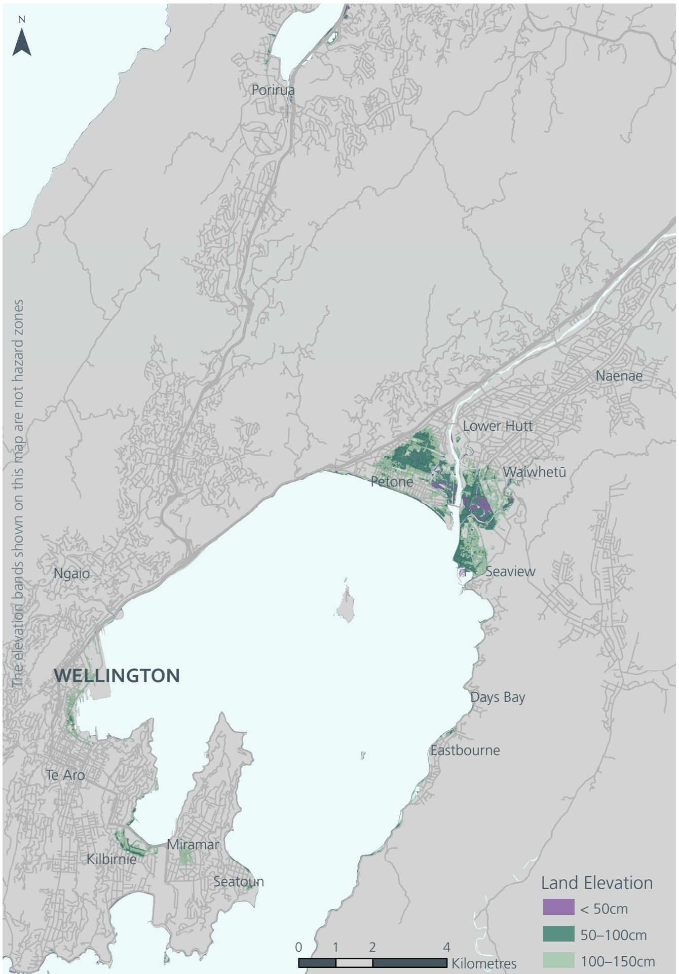
Low-lying coastal land in Wellington and Lower Hutt.