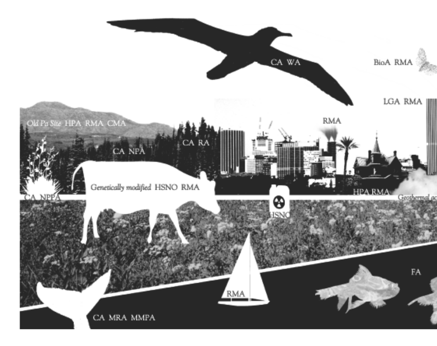
Diagram of the Acts referred to in the text to demonstrate some of the linkages and comple

and seabed which is likely to have implications for the environmental management of these areas. Of significance is a High Court decision in 2001<sup>ix</sup> concerning the Marlborough Sounds. Despite the findings that the foreshore and seabed were not considered to be "customary Maori land", the Court made it clear that this did not preclude Maori from establishing other customary rights over the foreshore, the seabed and waters, short of exclusive possession and ownership. This would include traditional relationships and customary rights such as fishing and gathering.