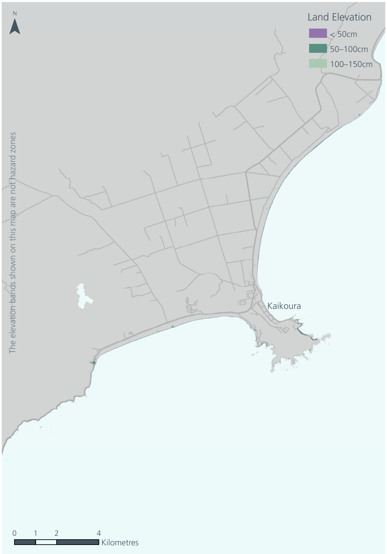
Low-lying coastal land in Kaikoura.